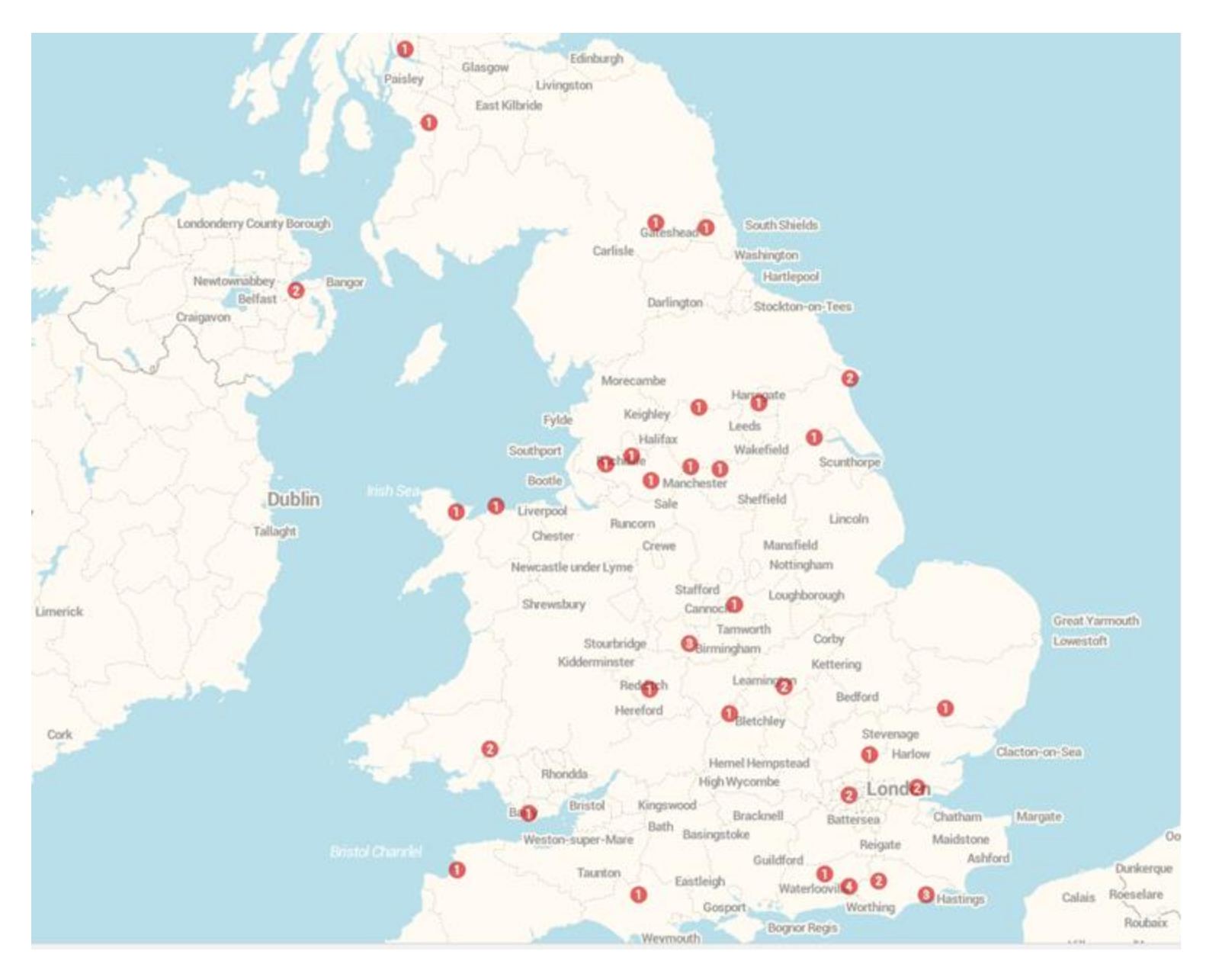
Figure 1. Map displaying location of participants interviewed